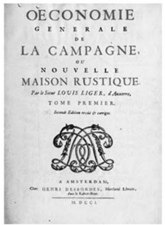
Fig. 3. Books authored by La Quintinie (1695) and Liger (1701). Images were obtained from following URL. (left) https://archive.org/details/leparfaitjardini00lagu, (right) https://archive.org/details/oeconomiegeneral00lige.