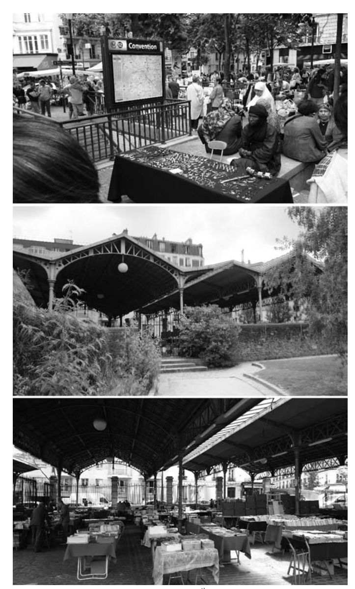
Fig 1. Book market at Parc Georges Brassens in 15<sup>th</sup> arrondissement, near Paris Expo Porte de Versailles, in Paris. (Top) Day of market around the nearest metro station, Convention. (Middle) Book market viewed from the park. (Bottom) Weekend book market with serious book lovers.

We have established Centre Franco-Japonais d'Histoire des Science (CFJHS) basing in Paris and Kitakyushu in 2007, as the platform for such activities aiming at preservation, classification, digitalization, translation and re-evaluation of the classical biological literatures from Sorbonne-related libraries, by making uses of the collections kept in both